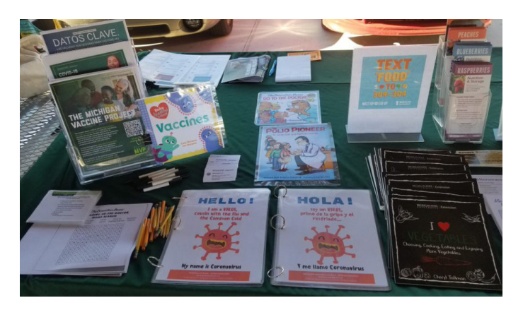
Michigan Vaccine Project materials available at the Kalamazoo Farmers Market.

The Michigan Vaccine Project. Vaccination prevents community spread of disease and protects Michigan's most vulnerable residents, including babies, immunocompromised people and older adults. Through the Michigan Vaccine Project (MVP), MSU Extension partners with the Michigan Department of Health and Human Services to provide people with trusted, evidence-based vaccination information. As part of this work, MVP launched a statewide outreach campaign using digital, radio and print materials — as well as in-person and virtual education programming — to inform Michiganders' vaccination decision making. In 2022, MVP hosted six educational webinars, with topics ranging from childhood immunization recommendations to safe holiday gatherings; 130 people attended. Also as part of MVP, a group of 4-H youth ambassadors offer peer-led education in communities throughout the state and are creating a youth-led vaccine education campaign of their own. By December 2022, the MVP team had onboarded 11 youth ambassadors.