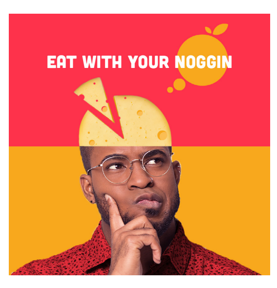
A promotional graphic from the Think Food Safety social media campaign.

Think Food Safety resources. Think Food Safety (TFS) began in 2020 as a food safety awareness campaign to educate the public on safely purchasing from food vendors and to encourage prospective entrepreneurs to safely launch their Cottage Food businesses. In 2022, the TFS team grew its social media channel and launched a podcast with five episodes, with topics from preserving garden bounties to licensing a food business.