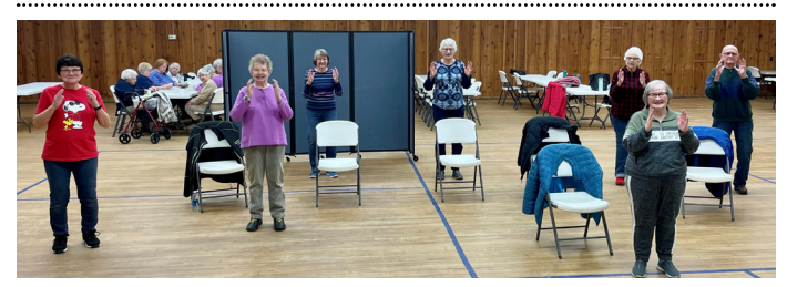
Participants enjoy a Tai Chi class led by MSU Extension staff.

Mindfulness education, through Stress Less With Mindfulness and the Mindfulness for Better Living suite of programs. To better meet people where they are, MSU Extension offers a variety of mindfulness programming both in person and virtually. In 2022, MSU Extension educators held almost 100 virtual mindfulness events and programs, reaching 6,826 participants.