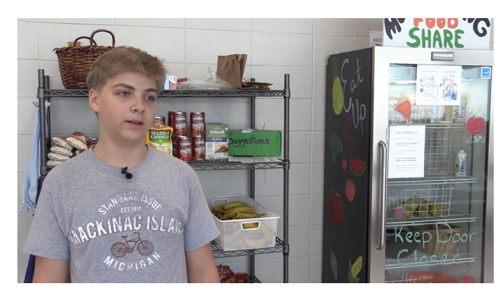
A student at Munising High School discusses the benefit of an MSU Extension project that created a free food pantry in the school.

Policy, systems and environmental changes (PSEs). PSE work focuses on changing environments such as schools, workplaces and community centers to make healthier choices easier for everyone. Switching out the sugary beverages in a school vending machine for healthier options is one example of a PSE change. In 2022, MSU Extension helped implement almost 37,000 PSE changes at 185 sites across Michigan, reaching 157,191 people.